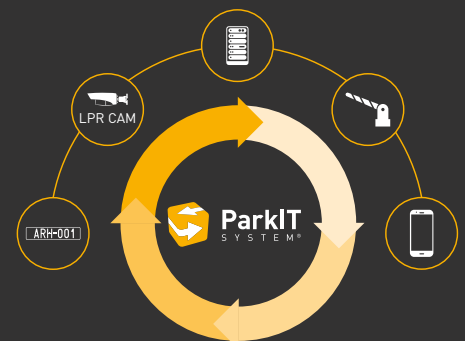
KNOWS THE INS & OUTS OF PARKING