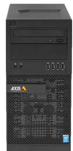
AXIS S9001 Desktop Terminal sold separately